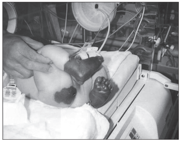
Figura 1. Typical skin lesions of neonatal purpura fulminans

Given that levels of our natural inhibitors of coagulation are already significantly reduced at birth, inherited deficiency of antithrombin, protein C or protein S would seem to surely result in major systemic thrombosis. Indeed, purpura fulminans or spontaneous diffuse thrombosis may be the initial presentation in neonates with homozygous inheritance and profound deficiency of any one of these three major anticoagulants. Purpura fulminans in the neonate is a life threatening emergency and may be observed in patients with homozygous factor V G1691A variant<sup>(36,37)</sup>. Skin necrosis, particularly in distal or less well perfused areas, is the hallmark of protein C and S deficiency requiring emergent infusion of fresh frozen plasma and initiation of anticoagulation<sup>(36)</sup>.